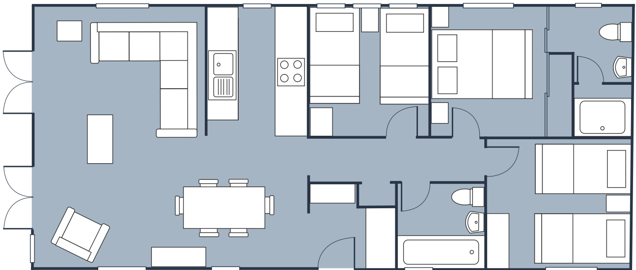
The Bowmoor | 45 x 20 | 3 Bedroom

For more information, or to arrange your personal viewing appointment, please contact us on: